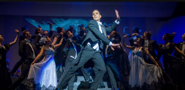
Broadway Lights in collaboration with the Victoria Symphony