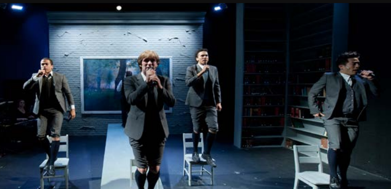
Spring Awakening in collaboration with the Belfry Theatre